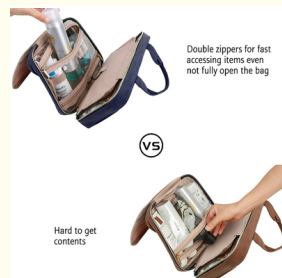
Hard to get contents