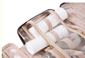
Double zipper for fast accessing items