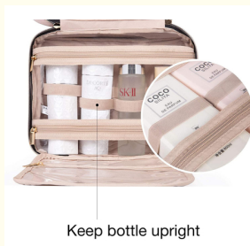
Keep bottle upright