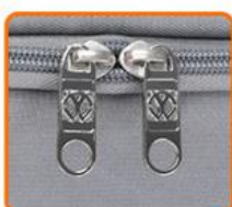
METAL DEBOSSED ZIPPER PULLER