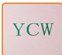
SILK SCREEN PRINTING