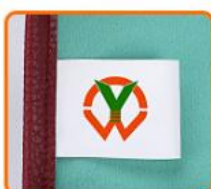
WASHING CARE LABEL